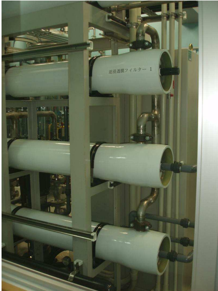
RO Membrane Units