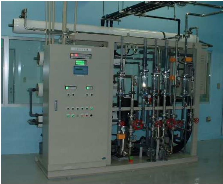
RO system Controller